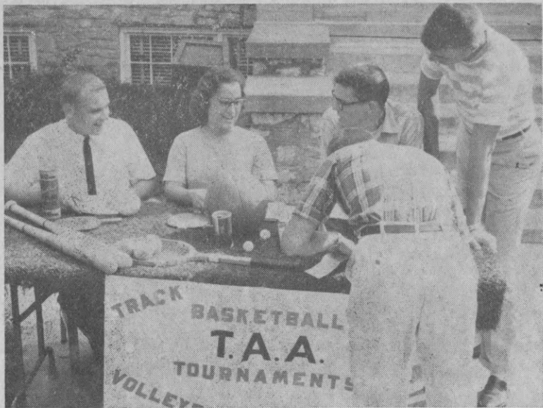
Athletic minded students join TAA on registration day.