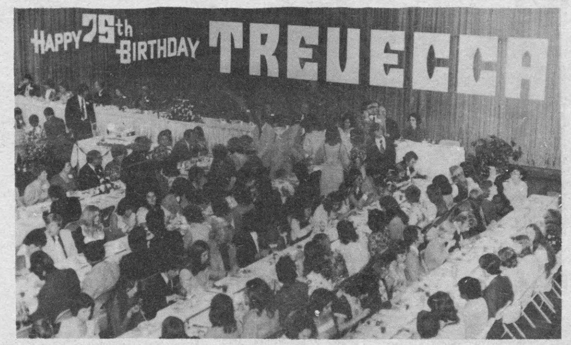
Students, staff, faculty, and friends gather in the gym for 75th birthday celebration.

Happy Birthday, Trevecca. And many more.