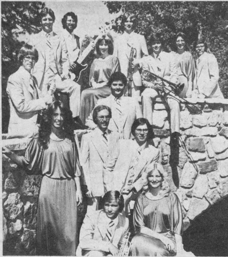
The '79 Edition of Discovery, another exciting "ministry" group.

Inside my room, I hear the people crying. They do not know; They do not understand. Beyond these walls, Millions are slowly dying. They've never tasted fruit From Canaan's land.*