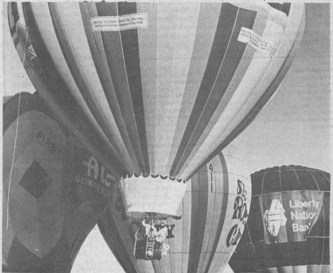
Balloon races make for an exciting Fall afternoon

The Nashville race is the sixth stop on a seven-city tour in this, the second year of professional balloon racing. This is a rapidly growing sport, reflecting the expanding numbers of licensed hot-air balloon pilots in the U.S. (more than 3,500). Sunday, October 21st, has been selected as the alternate race day in case of bad weather Saturday.