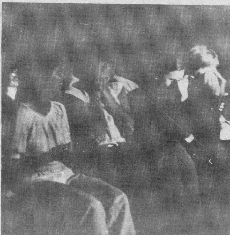
FLASHBACK: How did Steve Camp embarrass these good Christian concert-patrons?

Saturday, October 6, 1979, a concert will be held at Lord's Chapel beginning at 7:30 p.m. Brethren and The Songwriters will be performing and a love offering will be received. Lord's Chapel sponsors many concerts through the year. We will try to keep you informed.