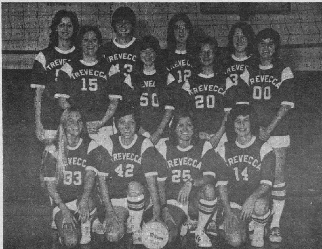
Women's Intercollegiate Volleyball Team