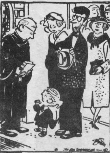
"What are you gonna buy with my dad's quarter?"

In short, adult citizens of the United States should have the right to decide for themselves the moral code by which they live their lives. The sooner our government realizes that fact, the better off we'll all be.