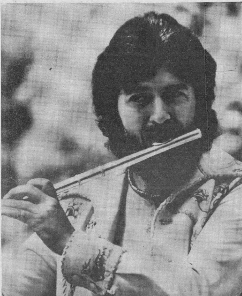
MAKE WAY FOR RAY — Flautist-singer-composer Ray Thomas is the latest member of the Moody Blues to come out with a solo album, "From Mighty Oaks."

Copyright, 1975, by United Feature Syndicate, Inc.